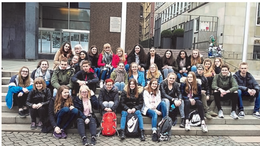
The whole group in Bremen - Can you see the Bremer Stadtmusikanten (town musicians) behind the group?

(Pictured right) Here's another statue to the famous fairy tale characters. Have you read this story?