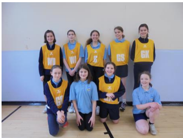
Year 7- Keller

On Monday 14 th February over 140 students took part in KNGS Inter House Netball Competition. Congratulations to all students who took part, the PE Department were impressed with their efforts, teamwork, leadership and sportsmanship! The winners were: