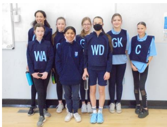
Year 8 – Nightingale