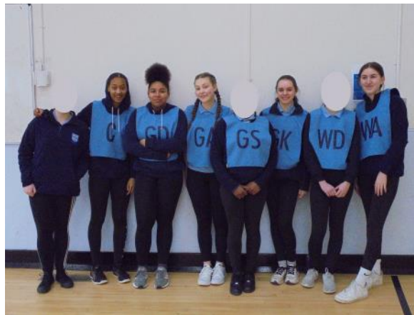
Year 10- Nightingale