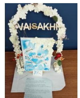
Demonstrating Respect & Courage in order to Flourish.