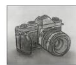
Raina N, 8-5, Goldfinch