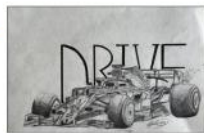
Talina K, 9-1, Kingfisher