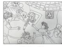
Chloe Lam, 11-1, Kingfisher