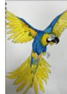
Neve Warrifores, 9-5, Goldfinch